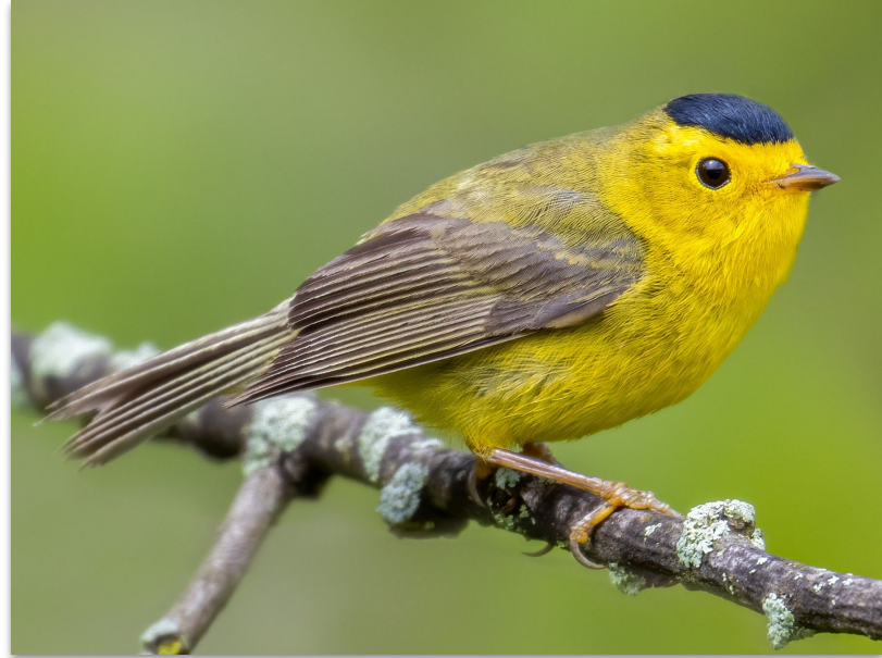
Wilson's Warbler ( Cardellina pusilla ), an example of a bird up for renaming.