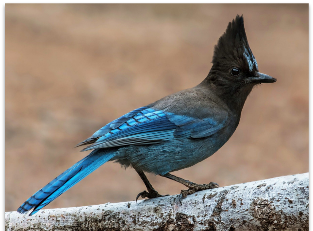
Steller's Jay ( Cyanocitta stelleri ), an example of a bird up for renaming.

The American Ornithological Society (AOS) recently announced that it will rename all bird species honoring people. As a result, as many as 80 birds in North America that were named after a person may receive a new common.